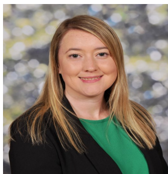
Name: Miss Love

Responsibilities: Supporting learning in Y3/4